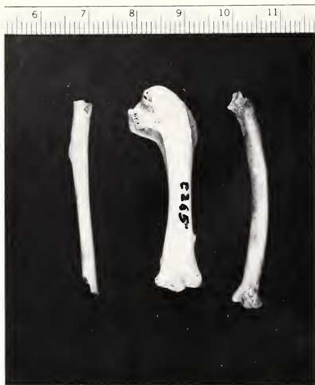
Figure 1. Archaeological specimens of Ectopistes migratorius from New Mexico (left to right): left tibiotarsus from Picuris Pueblo (No. 1192), right humerus from Una Vida (No. C265), left ulna from Una Vida (No. C271). (Scale in cm.)

Tibiotarsus with shaft narrower; and fibular crest less prominent.